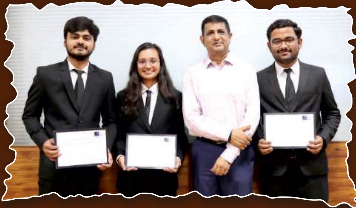
Qualified for the World Oral Rounds of the prestigious 21 st Annual Oxford International Intellectual Property Law Moot Court Competition and the team was awarded the 9 th best written submission in the world. Organized by Pembroke College, University of Oxford