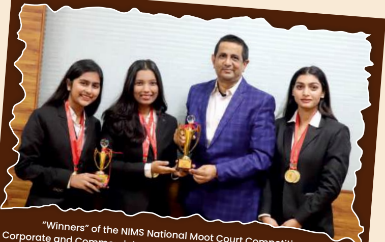
"Winners" of the NIMS National Moot Court Competition on Corporate and Commercial Law 2024 Organized by NIMS University, Jaipur. Additionally, the team was also felicitated with the "Best Memorial Award"